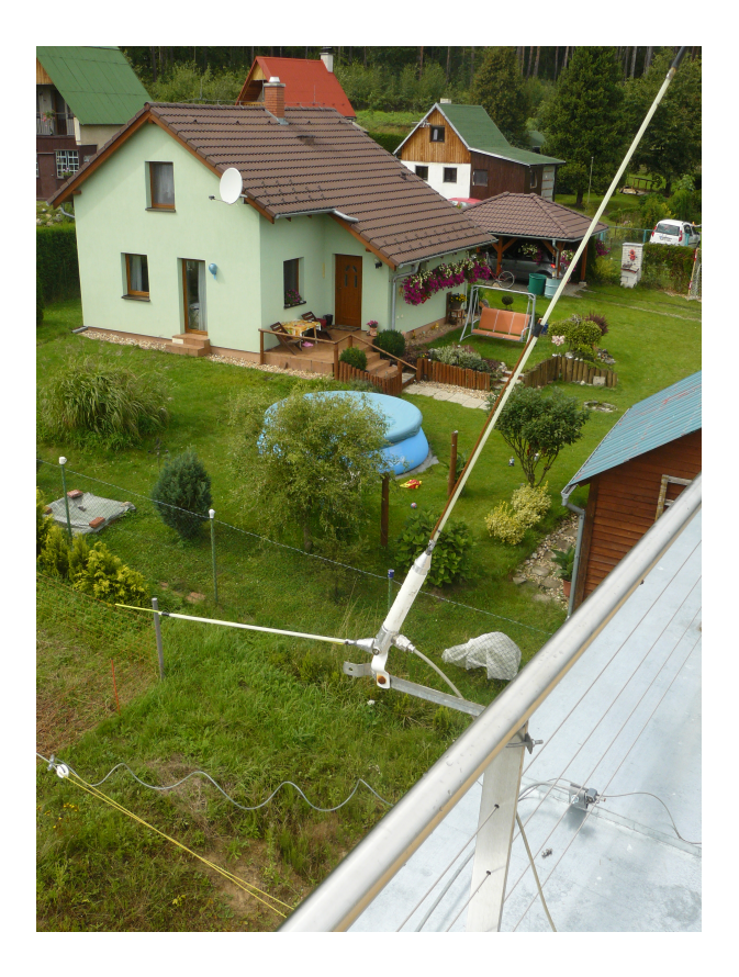
Figure 1: Antenna used at detection station