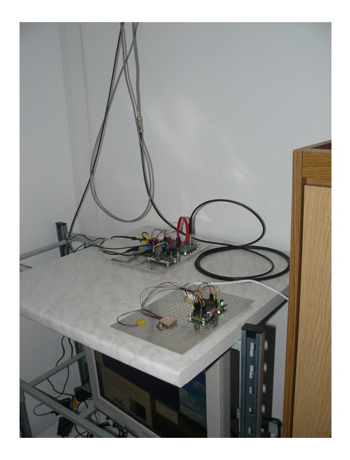
Figure 2: Example of meteor detector receiver setup